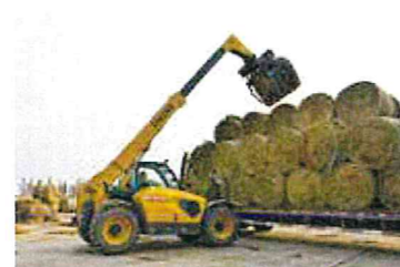
XC6-3007K Holding holding grass packing