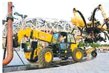
XC6-4517 telescopic handler backing at the 50 anniversary of diplomatic ties between China and France