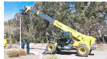
XCMG telescopic handlers help municipal constructions in Africa