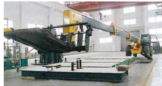
XC6-4517 has passed fatigue load and overload tests of 200,000 times