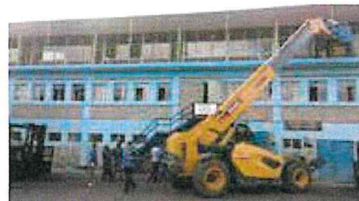
XCMG telescopic handlers help constructions of a factory building in Ethiopia